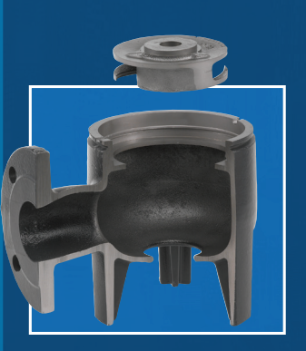
SLV: SuperVortex impeller

The SLV pumps range has a SuperVortex impeller and is ideal for liquids with a high concentration of solids, fibres, or gassy sludge, while the SL1 pumps range has a single-channel impeller and is ideal for large flows of raw sewage.